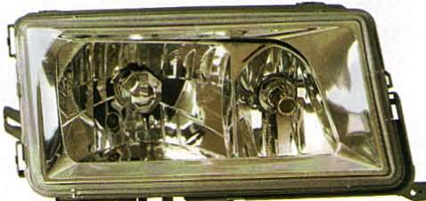
HEAD LAMP (W/PNEUMATIC ADJ.) 1set/4.18