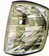
CORNER LAMP 10set/2.9'