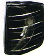
CORNER LAMP 10set/2.9'