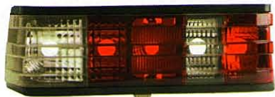
REAR LAMP 4set/4.08