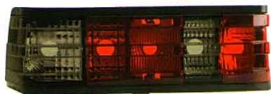
REAR LAMP 4set/4.08