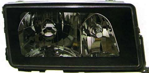
HEAD LAMP (W/PNEUMATIC ADJ.) 1set/4.18